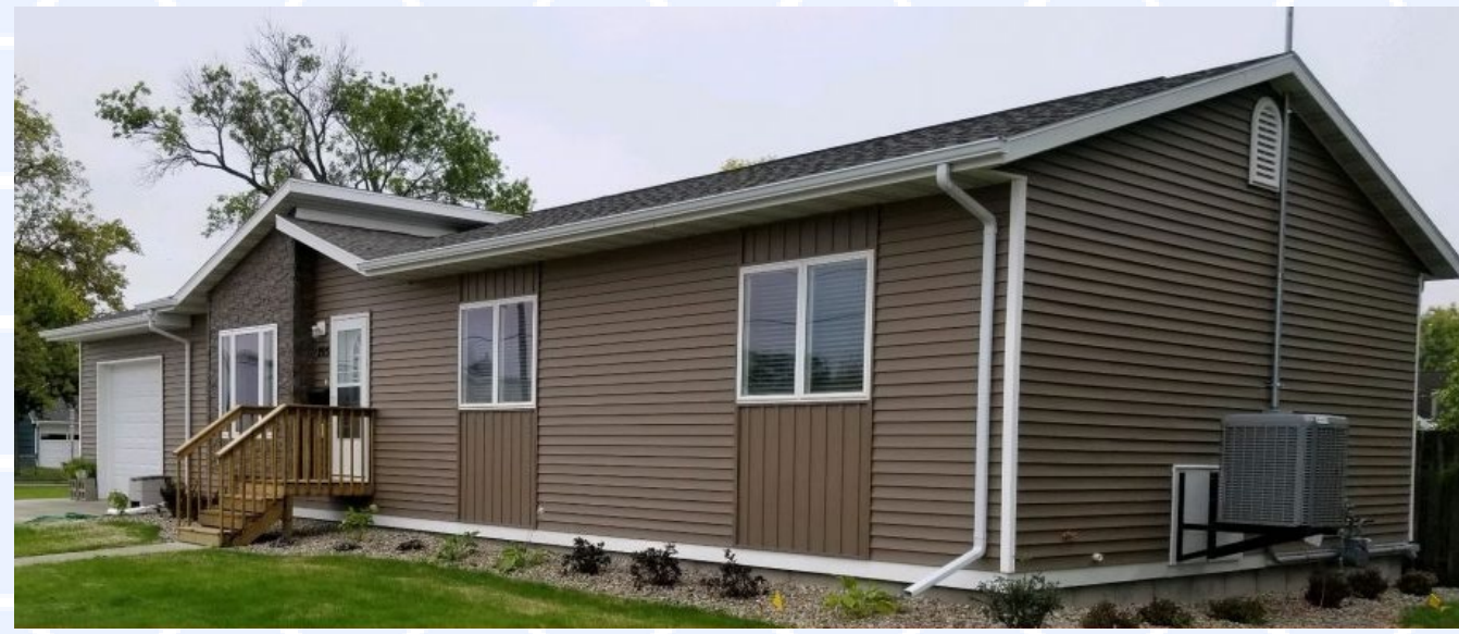
Region 6 project