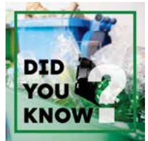
Image will open in a browser. Right click on the image and select “Save Image As” and choose the desired location on your computer to save the photo to.

CLICK ON EACH GRAPHIC TO DOWNLOAD AND USE WITH YOUR POSTS