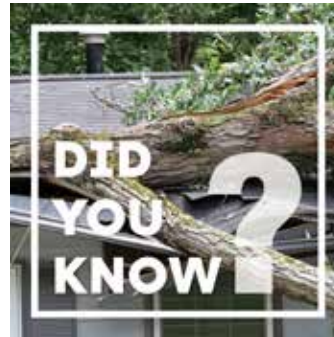
Image will open in a browser. Right click on the image and select “Save Image As” and choose the desired location on your computer to save the photo to.

CLICK ON EACH GRAPHIC TO DOWNLOAD AND USE WITH YOUR POSTS